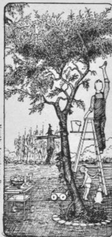
North American Pomona

Farmer, gardener, homesteader. 7 acres. Skills: Hard work. Interest: All areas of permaculture.